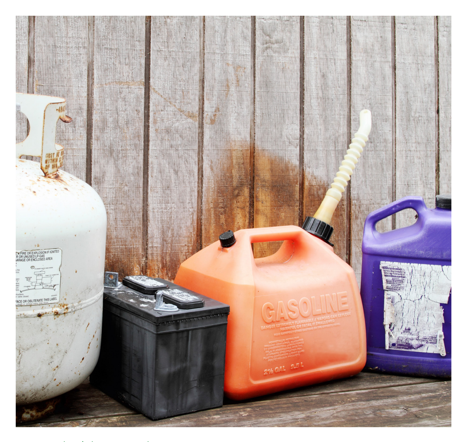
Household Hazardous Waste