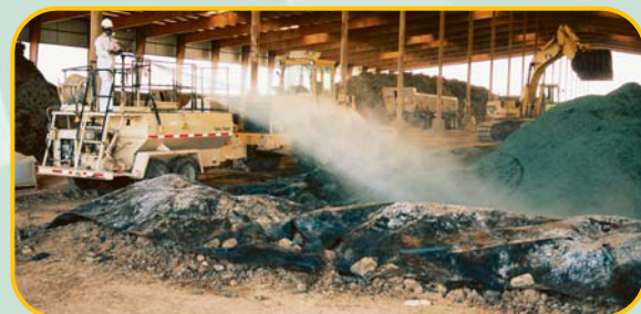
Treating contaminated soils on-site at bioremediation facilities is ultimately less expensive and more environmentally friendly.

DDT contaminated soils may be treated using the Xenorem ® bioremediation process licensed from AstraZeneca.