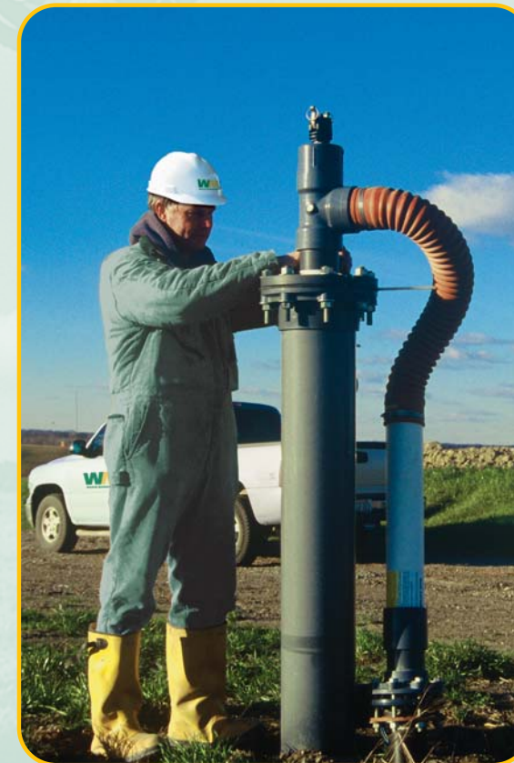
Next Generation Landfill Technology systems are carefully monitored to see that air and moisture levels are strictly controlled.