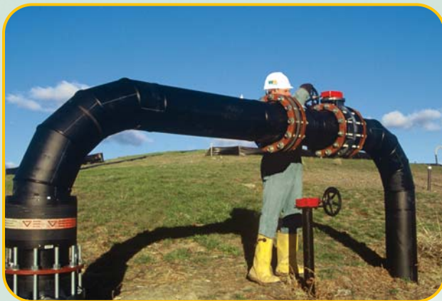
Next Generation Landfill Technology facilities employ both vertical and horizontal wells to inject the oxygen necessary to sustain the oxygen-metabolizing microorganisms that rapidly decompose organic waste matter.