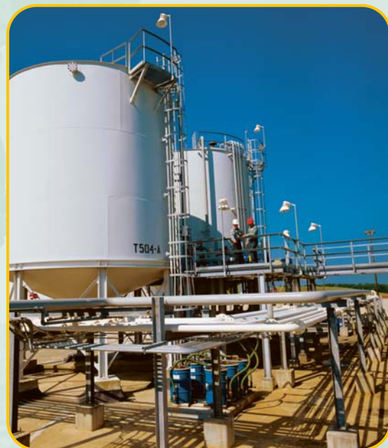
From everyday collection to environmental protection, Think Green. Think Waste Management.

Next Generation Landfill Technology represents just one more way Waste Management is looking ahead to meet the waste challenges of the 21st Century. For more information on Next Generation Landfill Technology projects currently underway, contact your Waste Management Landfill & Industrial Services sales representative, or log onto www.wmdisposal.com .