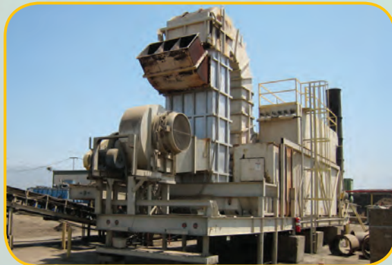
Our LTTD facility is conveniently located in Azusa, California near the 605 and 210 freeways.

Low Temperature Thermal Desorption technology makes it possible to quickly and efficiently remove non-hazardous organic and petroleum materials – such as petroleum fuels, hydraulic oils, jet fuels and crude oil – from contaminated material without negatively impacting the environment. This enables real estate developers, pipeline transmission companies, refineries, industrial businesses, manufacturers, schools and hospitals to conduct rapid soil remediation thus eliminating the hassle and potential liabilities tied to managing organic contaminated media.