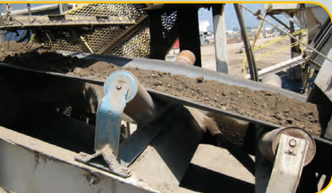
Discharged media is clean, contaminant-free, and ready for reuse.

For more information about Waste Management's Thermal Desorption capabilities and how they can help your business, please contact your Waste Management Manufacturing and Industrial Services representative at 800-WMDisposal (800-693-4776) or log onto www.WMDisposal.com .