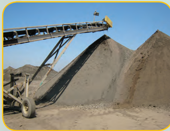
Our Azusa, CA facility can receive up to 2,500 tons of soil per day.

Waste Management's Thermal Desorption facility is conveniently located in Azusa, California near the 210, 57, 10 and 605 freeways, and is capable of receiving 2,500 tons of soil per day and temporarily store up to 40,000 tons at a time. This allows customers to complete remediation efforts in a timely manner thus reducing the number of days spent at the project site and tax advantages.