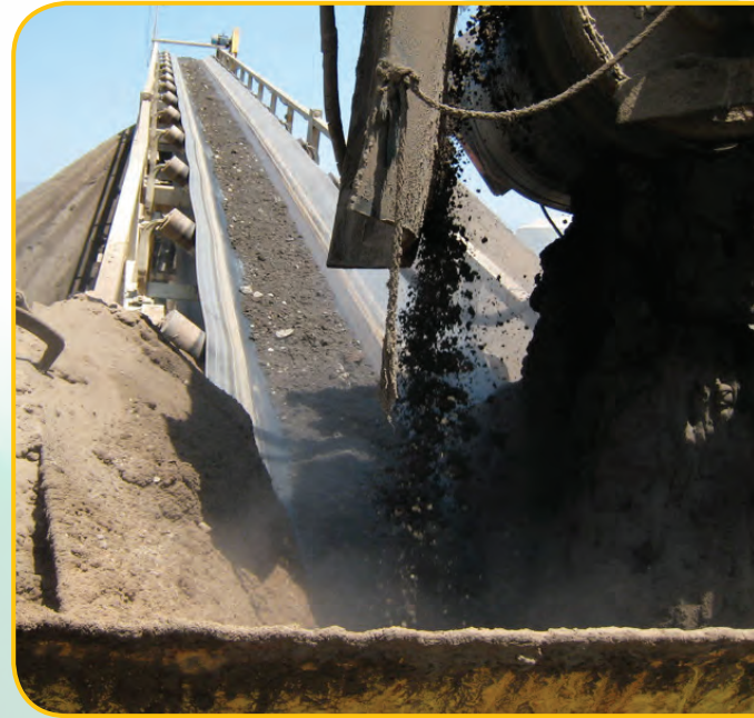
The LTTD produces clean, contaminant-free media at a rate of 30 tons per hour.

Waste Management’s Low Temperature Thermal Desorber (LTTD) plant is designed to deliver the fast remediation of soils containing heavy or longer chain hydrocarbons that require operating temperatures of >800°F to be efficiently and safely removed. The permitted desorption process is built around applying measured heat levels to contaminated material, by which the LTTD is able to produce clean, contaminant-free media at a rate of 30 tons per hour. Analysis and submittal of a Generator’s non-hazardous waste profile must be submitted in advance of scheduling.